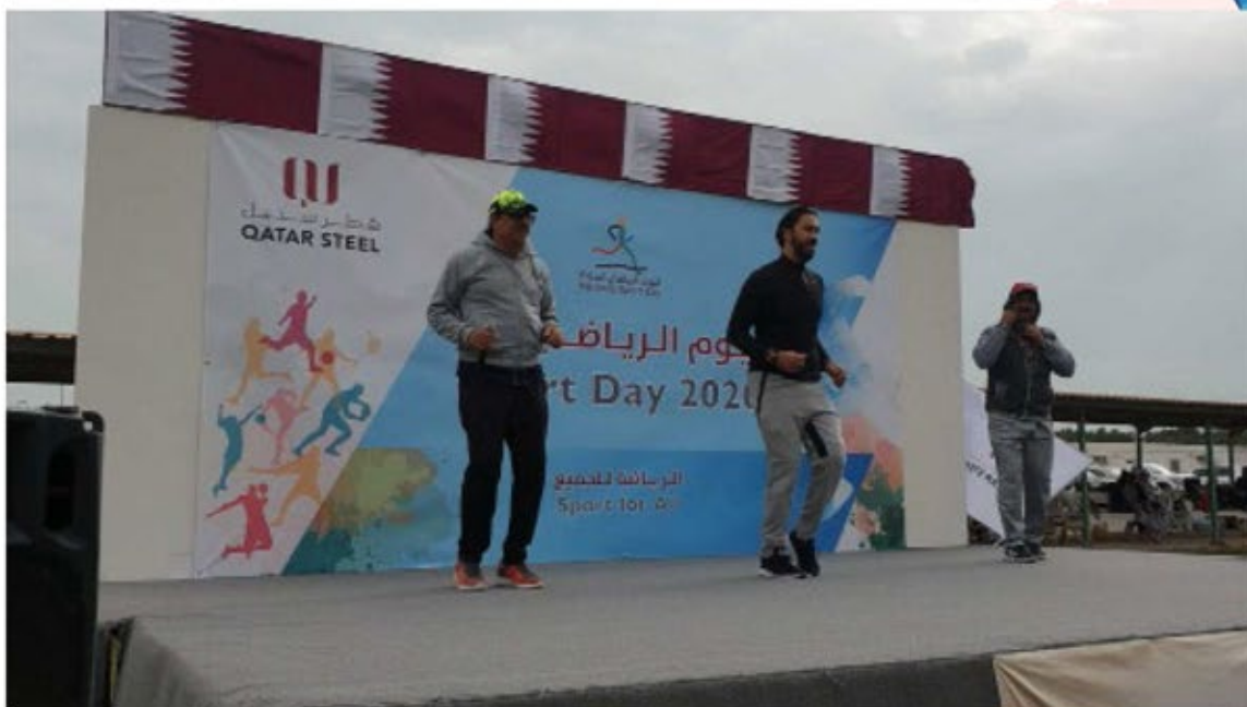
Click photo above to play the video.